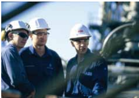
ABB offers Dodge® complete gear products. These gear products are manufactured to meet a specific need and are ready for application by a customer. Regardless of industry or environment, ABB offers a gearing solution that fits your needs.