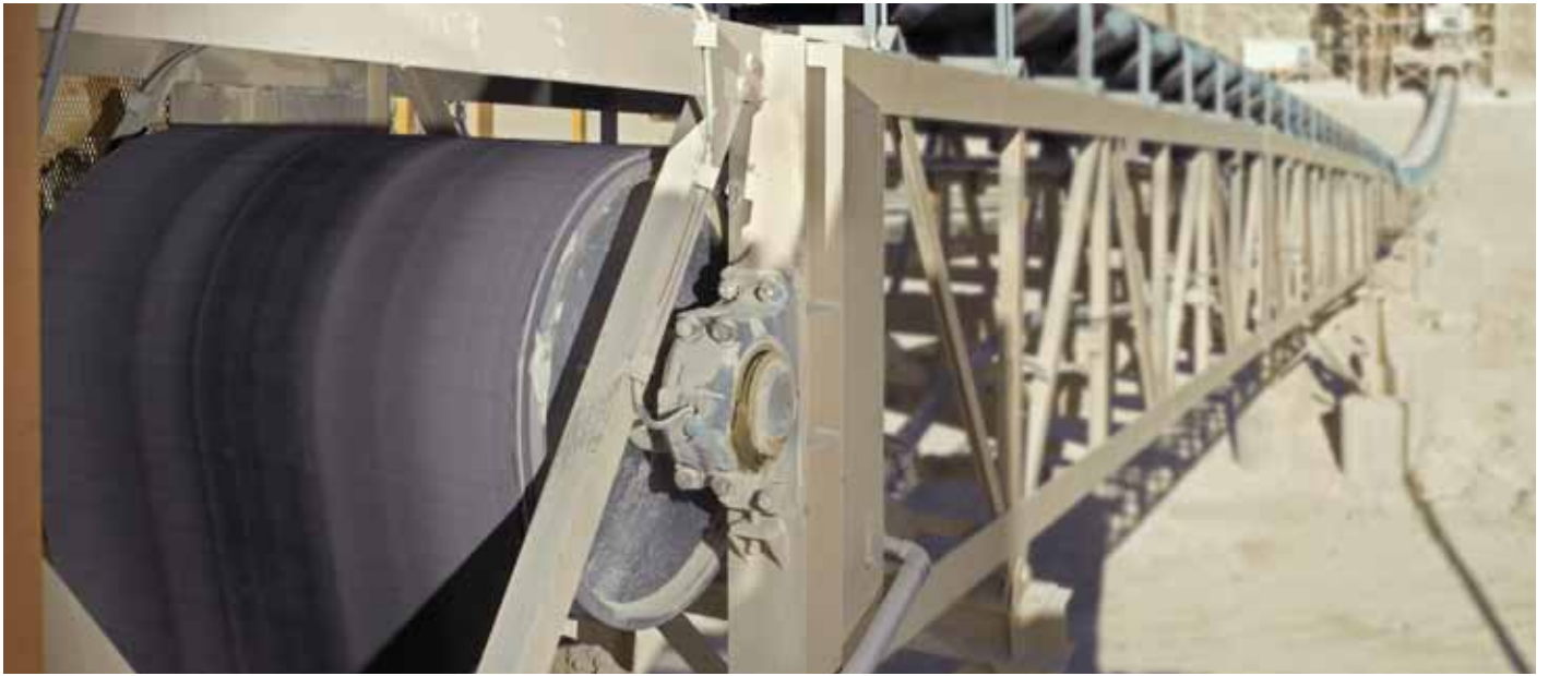
Controlled Start Transmission™ (CST)