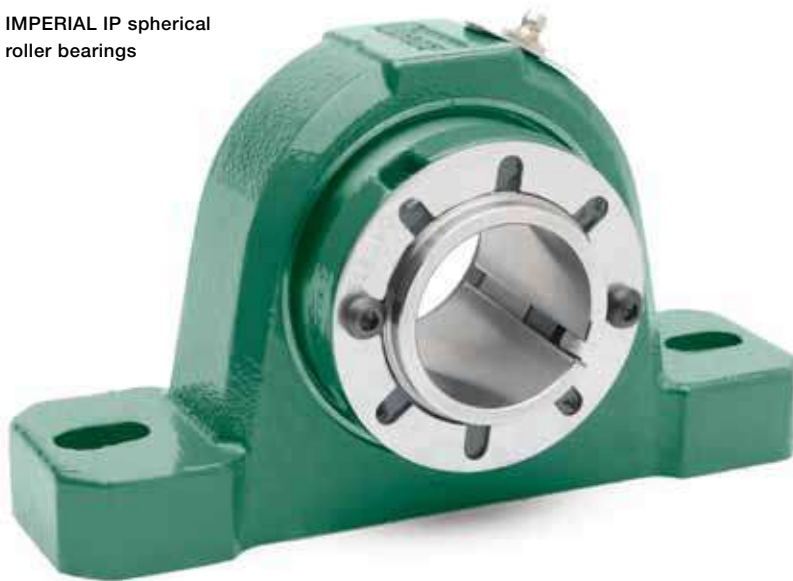
IMPERIAL IP spherical roller bearings